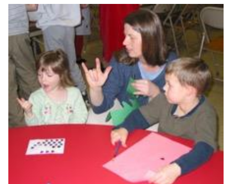
This is how you say “I love you” in sign language